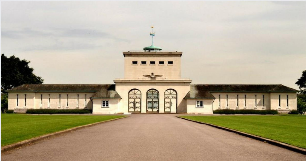
Here is the Runnymede Memorial in the United Kingdom.