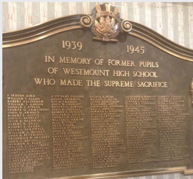
A tribute in Westmount High School commemorating all the students who went on to World War II and never returned.